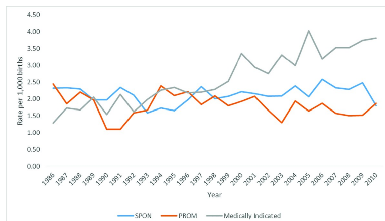
Fig 2. Prevalence of extreme preterm births by birth type including medical terminations and birth defects.

The incidence of spontaneous, preterm pre-labour rupture of membranes and medically indicated extreme preterm births including medical terminations and birth defects are displayed in Fig 2. The rate of medically indicated MI extreme preterm births significantly increased over time ( \beta = 0.94, p < .001 ; an increase of 0.10 per 1,000 births per year) whereas the rate of spontaneous extreme preterm births ( \beta = 0.20, p = .34 ) and preterm pre-labour